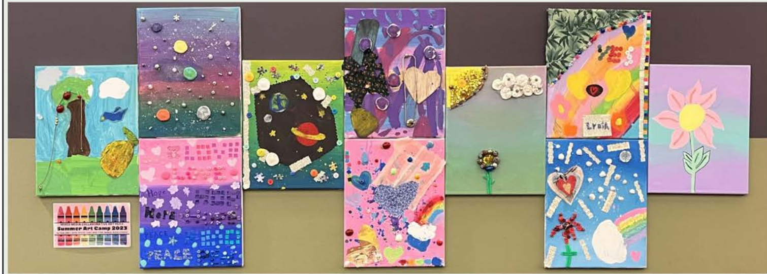
The final mixed media art pieces created by the Summer Art campers July 14th, 2023, displayed in the Youth Services Area.

100 E DOUGLAS ST | WWW.FREEPORTPUBLICLIBRARY.ORG | 815.233.3000