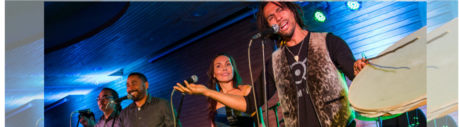
PAMYUA: ALASKA'S MOST FAMOUS INUIT BAND

100 E DOUGLAS ST | @FREEPORTPUBLICLIBRARY.ORG | 815.233.3000